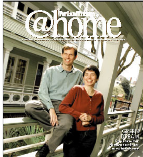
GREEN DREAM Couple turns their Northwest condo into an eco-friendly oasis

Tearing out the wall was the first phase of their remodeling project and the transformation was immediate.